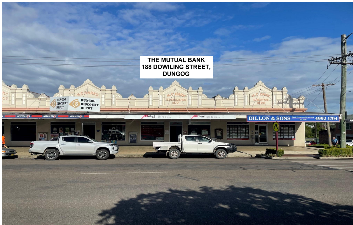
EXISTING STREET VIEW 'THE MUTUAL BANK' 188 DOWLING STREET, DUNGOG

There are similar existing external access ramps located at Dungod Shire Council building as well as 197 Dowling Street. Both buildings and access ramps are located approximately 30 metres from the proposed external access ramp at 188 Dowling Street.