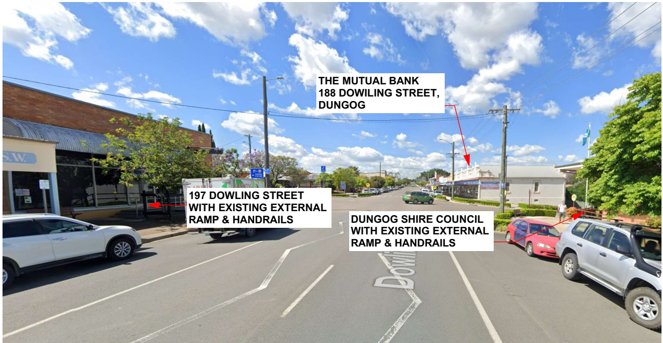
STREET VIEW - DOWLING STREET, LOOKING SOUTH TO 188 DOWLING STREET